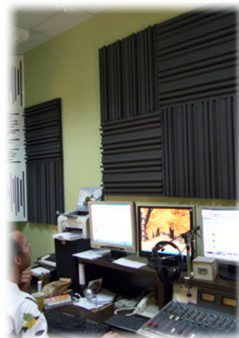
Radio - Lebanon